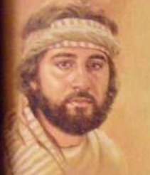
Judas (also called Thaddaeus)

an apostle. Do you know his name?— It was Matthias. Later, Paul and Barnabas also became apostles, but they were not part of the 12.—Acts 1:23-26; 14:14.