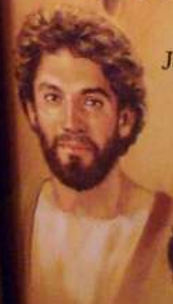
James (son of Alphaeus)